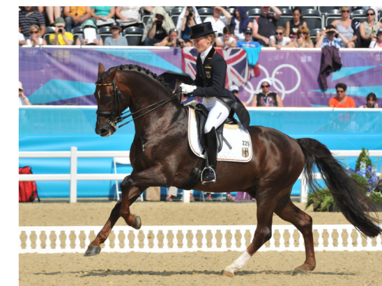
In extended canter, Damon Hill's powerful natural ability to take the weight behind is clear to see

Richard agrees that what you see should be what you get, adding: "If a high-speed film shows a 'faulty' canter, then so what? We shouldn't focus on whether a canter is three- or