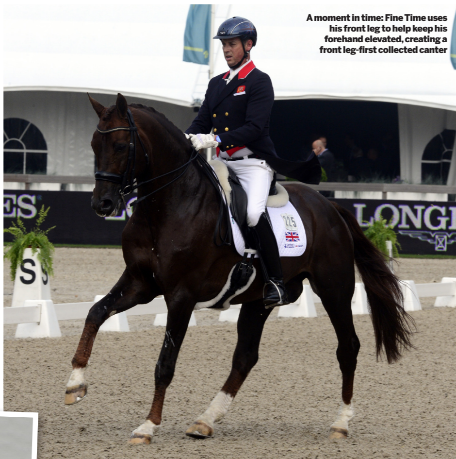
A moment in time: Fine Time uses his front leg to help keep his forehand elevated, creating a front leg-first collected canter

"DAP has been around for donkey's years. But it's down to the judges — these [top] horses shouldn't be getting the marks they are if they