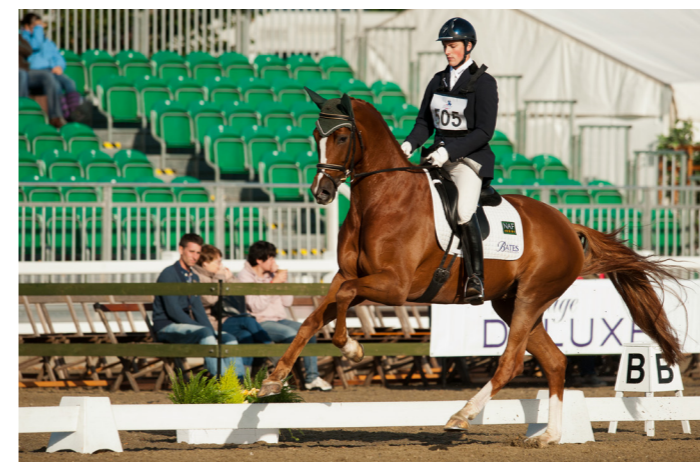
Left: four-year-old Farouche lands hindleg first, but after two years of further training (right) she brings the front leg underneath her shoulder more quickly for support