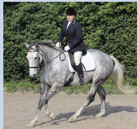
This horse is not in self carriage and is travelling on the forehand, displaying a front leg-first dissociation

"Perhaps the horse is slow behind or lacking jump or laboured. Really, all the horse is lacking is suspension and 'air time'. These are the qualities that make canter indisputably correct."