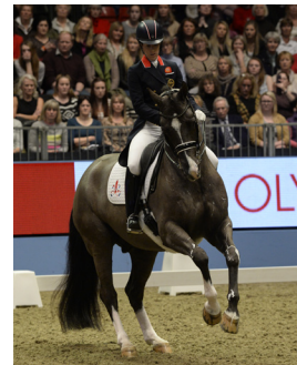
All these horses (Totilas, Glock's Undercover and Valegro) have received 10s for their canter pirouettes — but they do not maintain a three-beat canter, as specified in the FEI dressage rulebook. So is it time to change the rules?

four-time — other criteria are more important when judging with the naked eye.