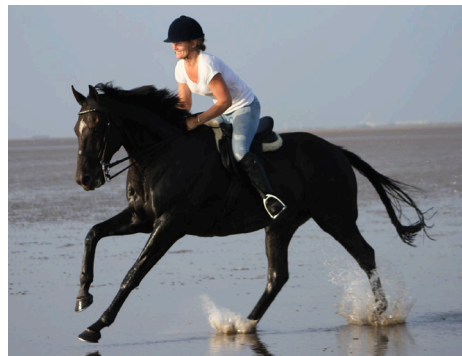
In gallop, the hind foot of the diagonal pair touches the ground before the front foot

So next time you see that catch-all phrase 'four-time' written on your dressage sheet next to an undesirable canter mark, it might be worth having a quiet word with the judge to unpick exactly what it is they think they've seen. H&H