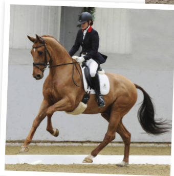
As a young horse, Zidaane — a big, exuberant mover — touches down hindleg first

"What you're seeing in elite young horses is the hind leg of the diagonal pair hitting the ground first, known as diagonal advanced placement [DAP]," he explains. "It is a disassociation between the hind limb and diagonal fore limb; in modern sport horses we're training to adjust the weight distribution to be shifted towards the back. Horses are naturally 60% on their forelimbs and 40% on their hinds and this disassociation demonstrates the horse's natural ability to take weight back. It's categorized as a positive thing as it's a sign of ability to collect."